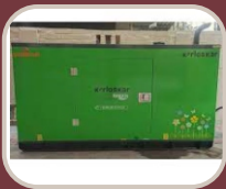
GENSET WITH ATT DEVICE