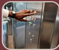
LIFT WITH ARD DEVICE