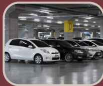
COVERED CAR PARKING