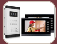
VIDEO DOOR PHONE