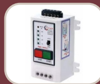
SEMI AUTOMATIC WATER LEVEL CONTROLLER