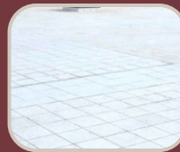
COOLING LIME TILES AT TERRACE