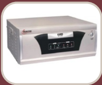
INVERTOR POWER BACKUP