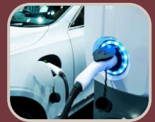
ELECTRIC VEHICLE CHARGING POINT