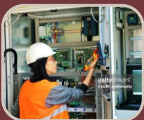
EB PANEL BOARD